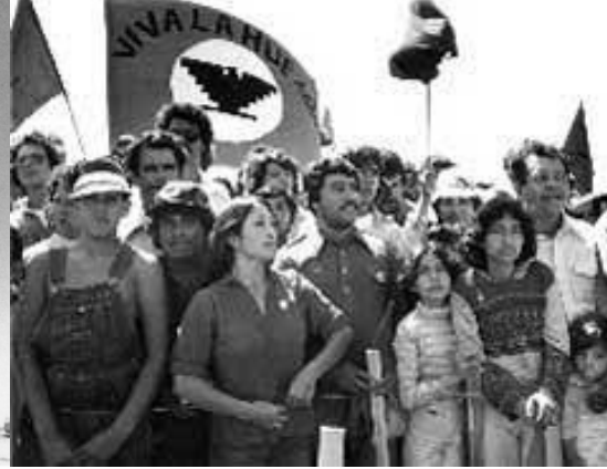
United Farm Workers