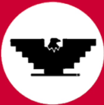
United Farm Workers

"The Aztec eagle is a historic symbol for the people of Mexico...The white circle signifies hope and aspirations. The red background stands for the hard work and sacrifice that the union members would have to give." 13