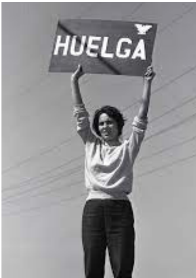
Dolores Huerta, United Farm Workers

Created in the early 1960s by César Chávez and Dolores Huerta, the United Farm Workers union was the first farmworker's union on the West Coast to create union contracts for workers that ensured overtime pay, fair wages, and protection against heat stress and illness. 8