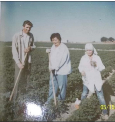
Dinuba, CA, 1971. My great-grandmother and two of her children harvesting beets.