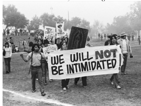
University of Washington

Mexican-American created the term "Chicano" during the Civil Rights movement as a rejection of White-American cultural assimilation. Chicano history is intertwined with farmworker advocacy and Chicano student activists have worked with PCUN, UFW, and many other organizations during boycotts and protests. 14