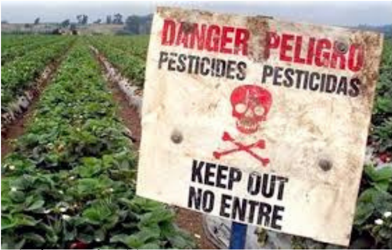
National Farm Worker Ministry

Pesticides are used to kill bugs that grow on crops. Workers who apply pesticides or who are exposed to “pesticide drifts” from neighboring fields are vulnerable to acute or server pesticide illness 4 . Unlike heat stress, pesticide illness can affect a worker’s family if a farmworker wears pesticide-exposed clothing around them. Pesticide illness can cause neurodegenerative diseases, fertility problems, depression, diabetes, and cancer 4 . The prevalence of heat stress and pesticide illness will only increase as climate change increases.