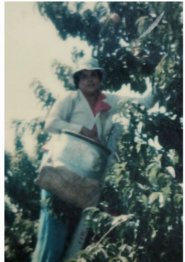
Yakima, WA, 1975. My grandmother picking cherries.