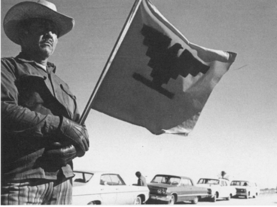
United Farm Workers