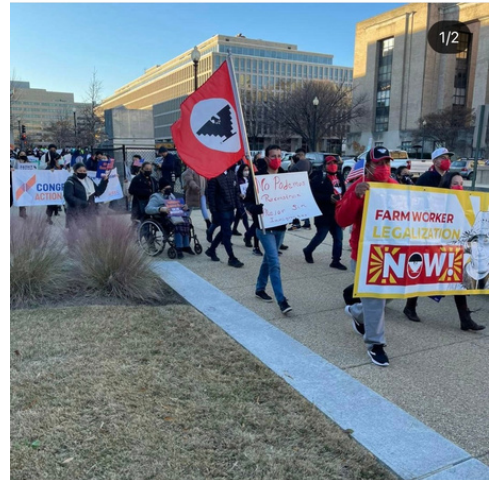
Farmworkers in Washington DC supporting the Farm Workforce Modernization Act that grants hundreds of thousands of farmworkers federal benefits, United Farm Workers.