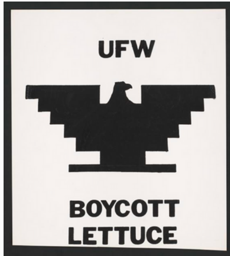
United Farm Workers